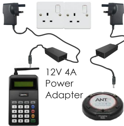
12V 4A Power Adapter