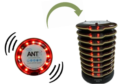
Default alert 8 sec beep 30 sec vibrate 30 sec flash

When the customer's order is ready, enter the guest pager number "2" into the transmitter and press SEND .