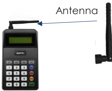
ANTFI Mini Transmitter